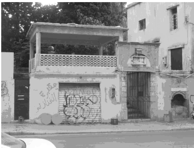
Entrance to Jewish cemetery in Sidon (Saida)

They now are living in Australia, Israel, Europe, and the